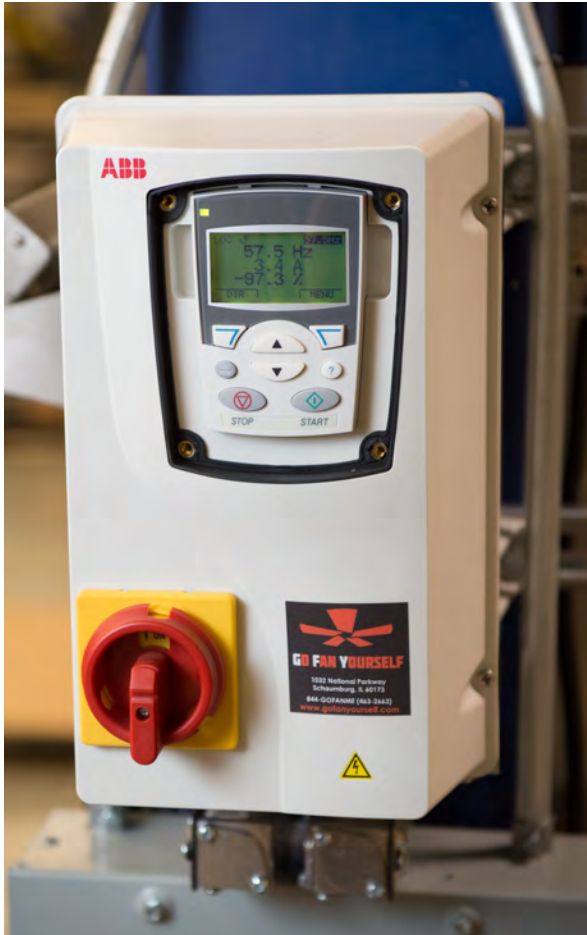
ABB ASC355 VFD Controller 200-240V 3 Phase 380-480V 3 Phase

CAT5 cable must be run from controller to Wall Mount Keypad location